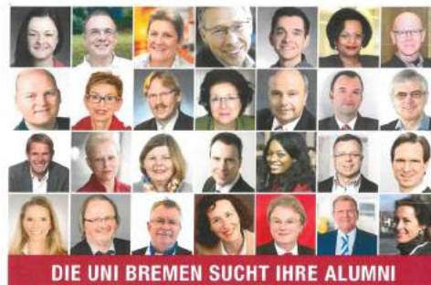
Campaign of the OPEN CAMPUS 2015

Celebrations are on for June 16 and 17! We will begin with our traditional summer fête on June 16, followed by the University of Bremen's OPEN CAMPUS on the next day. Their slogan 'Opening worlds – sharing knowledge' gives a taste of the colorful mix of information and entertainment, in which the university and its collaborators will present themselves. Info-tainment, as it is now called, can only mean: We're in! We will introduce the association and present our multifaceted nature to the visitors.