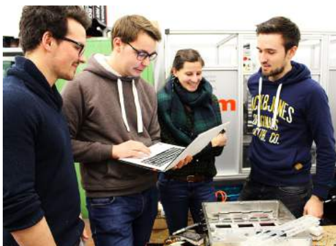
Group is working on cooling the electrical components

In the middle of the preparation phase for this year's race in the 'Formula Student Germany' (FSG) in Hockenheim, our alumni staff was allowed to be a fly on the wall in the workshop of student-organized racing club 'Bremergy'. Bremergy began development of its first race car only in 2012 – today, the interdisciplinary team counts more than 75 members from different degree courses such as Production Engineering, Electrical Engineering, Business Studies, Computer Science, and many more. Everyone weighs in with the knowledge they have acquired in their studies and their individual capabilities. In addition to the team management of five people, there are three departments. The business department has subdivisions such as controlling, marketing, human resources, and IT. The electronic department consists of the subdivisions accumulator, embedded intelligence, and powertrain. Members of the mechanic department are in charge of the subdivisions chassis, suspension, or aerodynamics. They make up a diverse crew – at full speed towards their future careers.