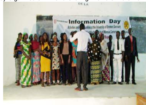
Club singing a german song

The event was an indication of how great the interest is in Cameroon in studying in Germany or doing a PhD there, and it additionally showed how important our alumni are in advising students and sharing with them their own