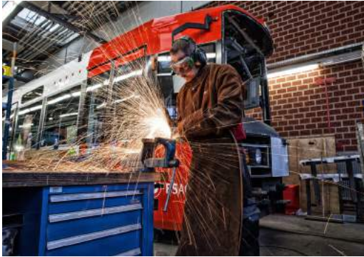
In the workshop of the BSAG

By means of 329 vehicles – among them the most cutting-edge trams and buses – Bremer Straßenbahn AG (BSAG) ensures mobility in Bremen every day. On March 14, 2017, members of the alumni associati-